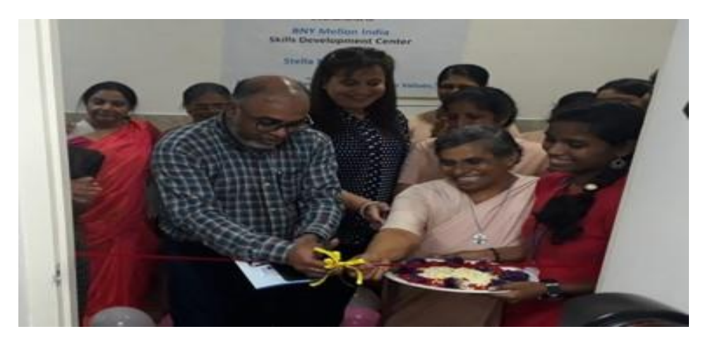
Inauguration of SMCDDRIVE Skills Development Centre

1 Credit Certificate Course in Employability Skills for Stella Maris College Students